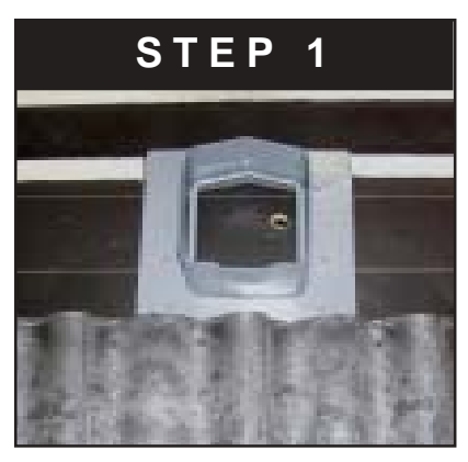
1) Place Commdeck directly onto roof deck over marked location. Bottom of Base unit should sit on roof deck just above top edge of tile.

Follow installation instructions in standard install booklet to determine Line of Sight. After determining the location, mark your location directly on the roof. Remove Cover from base unit and slide Aluminum flashing off of the base unit.