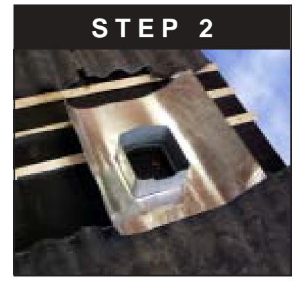
1) Slide aluminum flashing onto base unit to determine your tile height.

2) Pull cable through attic and continue to follow final assembly directions in booklet.