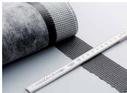
Standard nozzle for optimum weld seam width