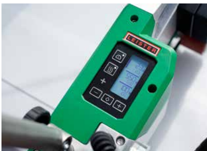
Regulated welding parameters

The compact UNIROOF 300 automatic welding machine is ideally suited for welding medium to large, flat roofs and is ideal as an entry-level machine due to its simple operation.